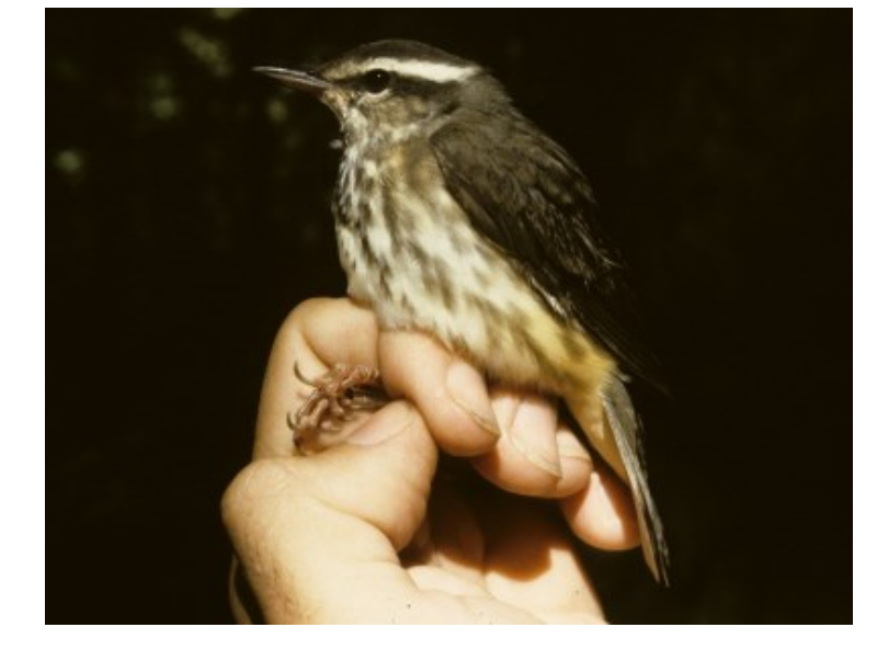
The Louisiana Waterthrush is one of our earliest spring migrants.